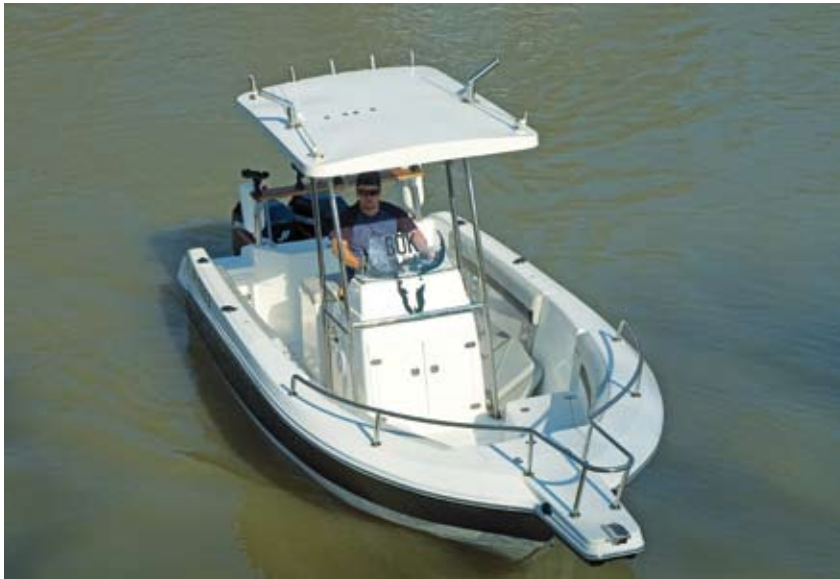
Caption XXXX caption XXXXX caption

I found she turns crisply with dual engines, and cavitations were minimal. This will prove to be important for quick getaways in the surf zone. As Bok mentioned, the 2100 CC powered into the swell and chop with ease, and I can only presume that pushing through sizable white water would not be an issue either.