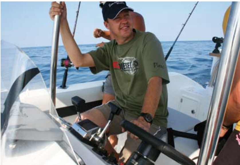
Caption XXXX caption XXXXX caption

Despite the Offshore 2100 CC being a ski-boat that's designed for rough ocean waters, she seemed equally at home on a dam or a river. And even though we couldn't give her sea legs a thorough test, the Vaal River produced almost perfect boating conditions so we could familiarise ourselves with her finer handling capabilities.