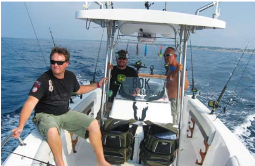
Caption XXXX caption XXXXX caption