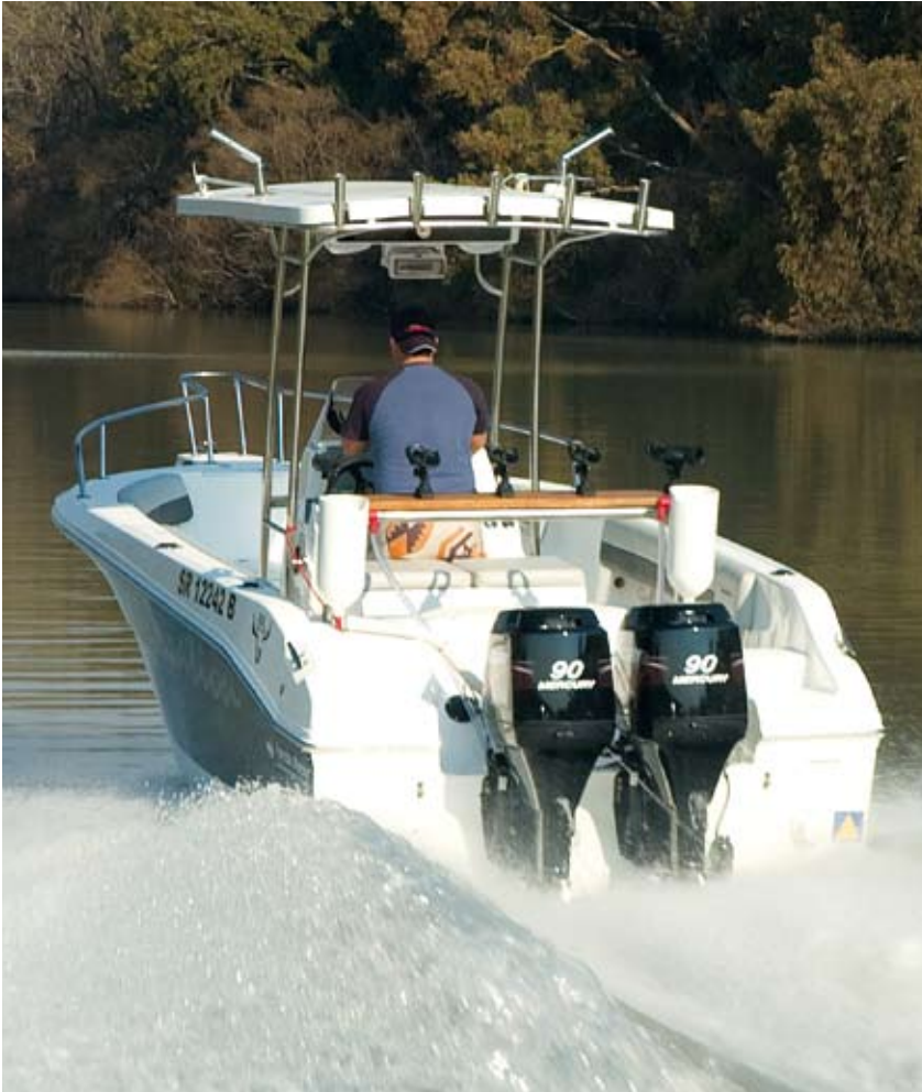
Caption XXXX caption XXXXX caption