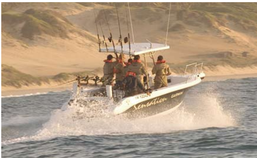
Caption XXXX caption XXXXX caption